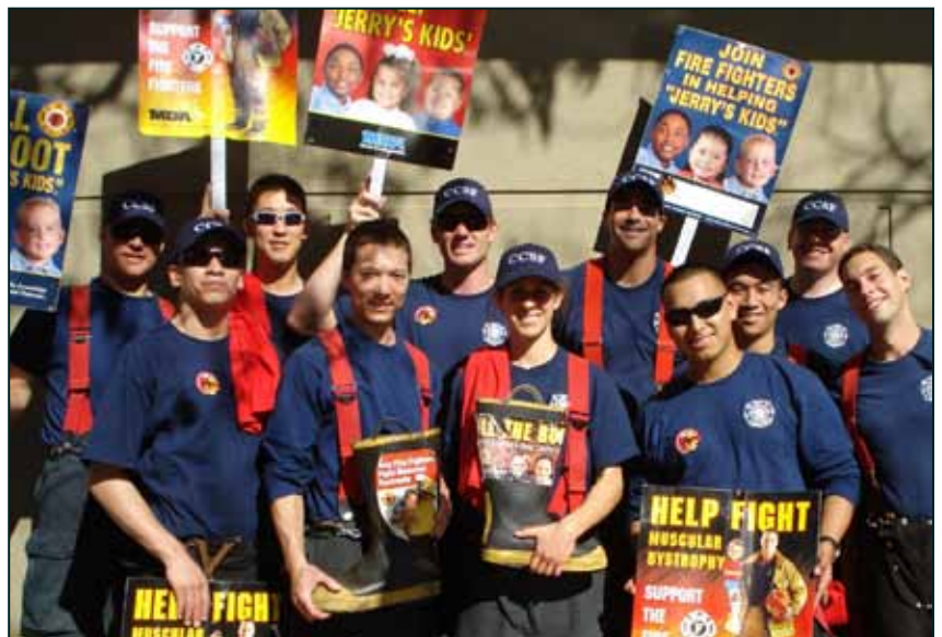
Top Left: Three eager CCSF Fire Academy volunteers ask that you fill the boot