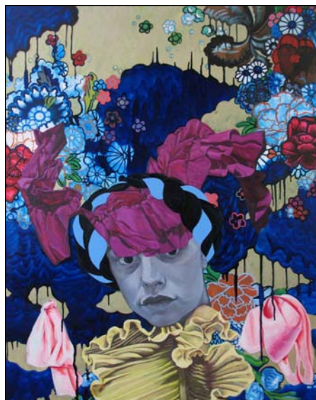
Dawn Black, "Admiral Eggpocket" 2006, oil on wood, 30x24 inches