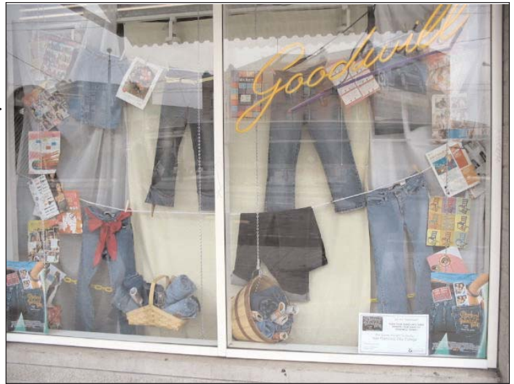
Here is how the window display created by the CCSF Image Consulting students looked.

Fashion 45 Image Consulting meets every fall, once a week and prepares students to become image consultants, either working independently or for a retailer. It incorporates the techniques of color, wardrobe selection, figure analysis and steps to setting up a business. For more information contact the Fashion Merchandising Department.