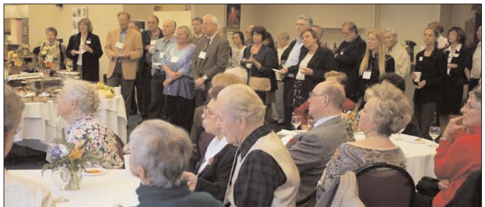
The Faculty Association Retirement Celebration held May 14 in the Pierre Coste Dining Room on the Ocean Avenue Campus was well attended.