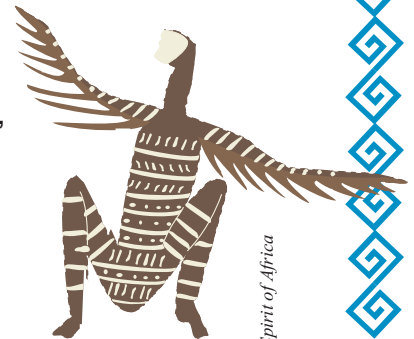
Spirit of Africa