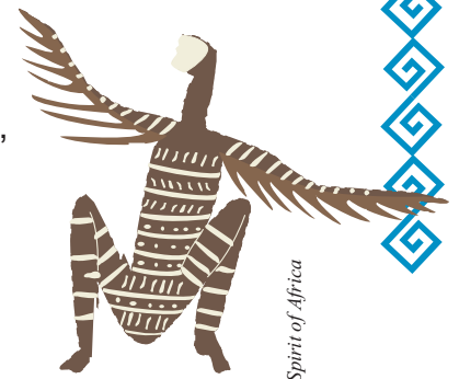
Spirit of Africa