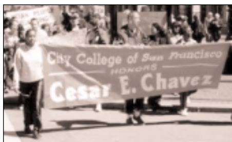
Mission Campus students carrying the CCSF Banner during Cesar Chavez March.