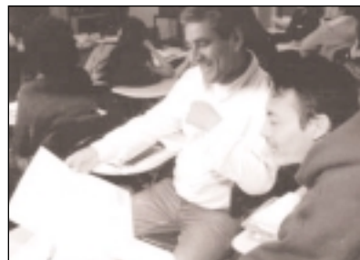
ESL students share ideas and make decisions on their projects.