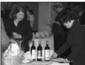
Guests at the gala (left) are shown preparing a bid on one of the many Silent Auction items available at the gala celebration on April 25

City College campuses also celebrated the college's 65th anniversary with open houses and special programs for the community. Pictured at right are prospective students visiting the 1400 Evans Avenue Campus.