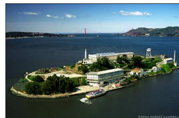
Alcatraz Island "The Rock"